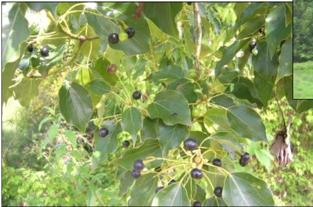
Leaves and fruit

For further information, contact the NSW Department of Primary Industries, Local Land Services, Landcare or Port Macquarie-Hastings Council's Noxious Weeds Officer on 6581 8111.