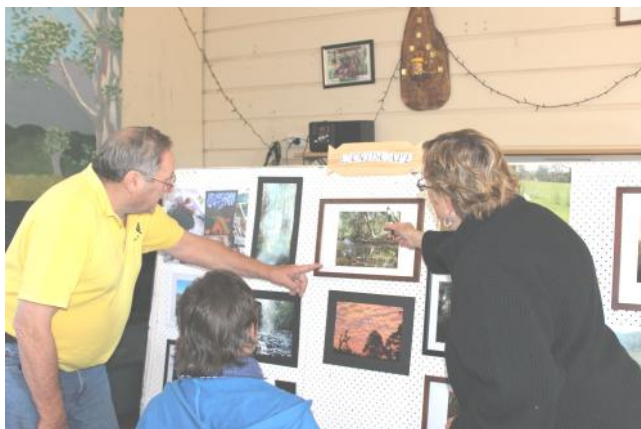
The judges were impressed by the quality of the entries