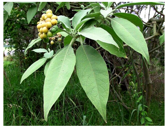
Leaves and ripe fruit

Tree Tobacco is a large shrub to small tree to 4m with a straight, green trunk and an open-branched spreading habit. Flowers are lilac and produced year round, followed by clusters of round, yellow fruit to 12mm, each with numerous small