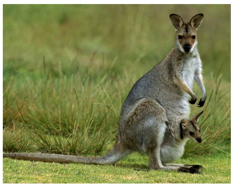
A Red-necked Wallaby with her joey—'Red-necks' are the most commonly sighted macropods in the valley

Macropod is the general term for the family of kangaroos and wallabies. Their smaller relatives, the potoroos and bettongs, will be covered some other time. Since moving to the valley early last year we have seen three different kinds of wallabies and one kangaroo. We hold out hope that at least two other kinds are still found in the valley and look forward to seeing them. One other kind of wallaby that used to occur in this area is probably locally extinct.