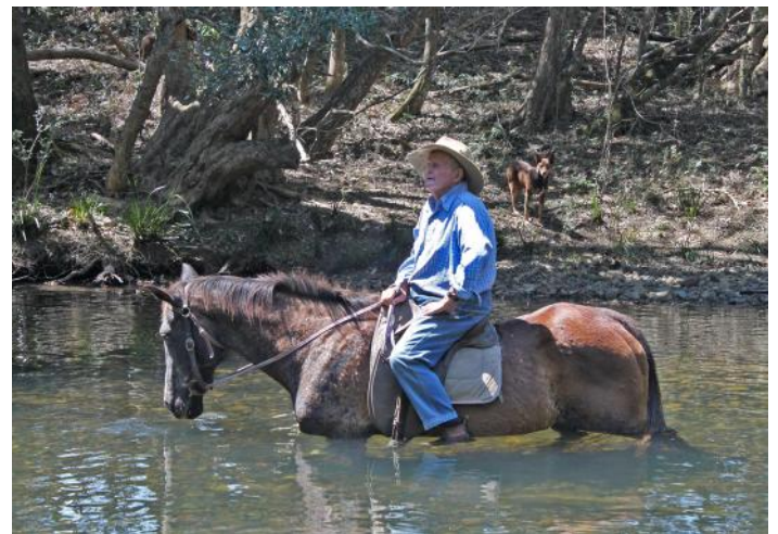
On his trusty horse, Ruby, in Pappinbarra River 2012

Have you seen the new improved classifieds section on the back page? If you are a PPA member the first month is free! Advertise things for sale, houses to rent, livestock for sale, excess produce, help wanted, babysitters, etc!