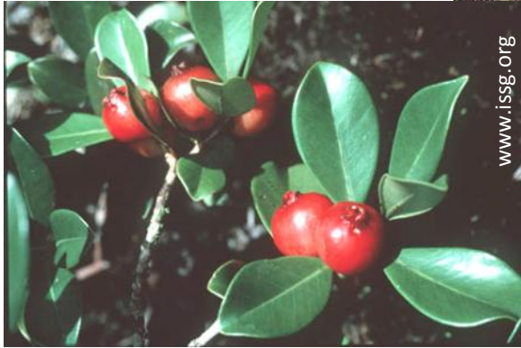
Leaves and ripe fruit

The idea for featuring cherry guava as plant of the month occurred to me as I was tucking into one the other day at home. We inherited about six different types of guava when we moved here five years ago: three cherry guavas, one common guava ( Psidium guajava ) and two pineapple guavas (or feijoa) ( Feijoa sellowiana ). All are vulnerable to fruit fly and, regrettably, both Psidium species are also capable of naturalising beyond the garden fence (if anyone has knowledge of pineapple guava spreading from dispersed seed, I would be very keen to hear about it).