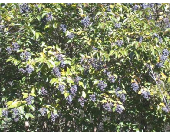
Broad-leaf Privet Fruit

http://www.dpi.nsw.gov.au/agriculture/pests-Macquarie Hastings Local Government weeds/weeds/profiles/privet/privet-image-gallery