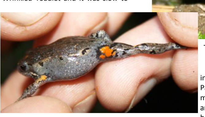
something big (like us) approaching, he stops calling and won't start again for AGES! After a long patient wait in the rain we finally zeroed in on one and found him, a small, dark guy with a warty back and surprising pretty orange patches

make it to the list because it is very hard to see. Making a deep clicking sound, the male hides in a small depression on the ground often under grass at the side of a dam or a water-soaked ditch — waiting for a female. As soon as he detects