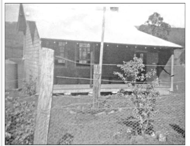
The Ellengrove School in the '50s

The middle school, then called Bappin, began in 1900 in a small structure, probably built of slabs with the supporting poles set in the ground, on Crown land surrounded by the McCarthy property where Blythes now live. It closed briefly during the First World War, to re-open in 1918 near the river on the Hollis property, inside the Fernleigh gate. A fanciful story was told of its being pulled there on a