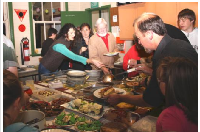
A great feast was enjoyed by all