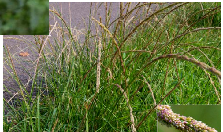
Giant Parramatta Grass is a clumping grass up to 1.6 m tall with seed heads up to 50 cm long.

FURTHER INFORMATION - Port Macquarie-Hastings Council (Noxious Weeds Officer) 6581 8111; NSW Dept. of Primary Industries www.dpi.nsw.gov.au or 1800 808 095; Weeds Australia website www.weeds.org.au