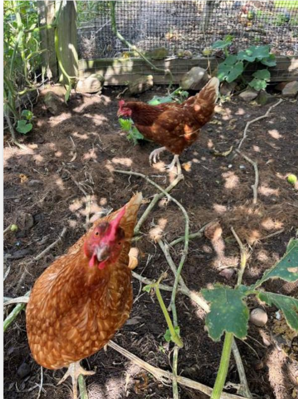
ISA Browns are prolific layers but don't live as long as other chooks. Note the wire on the left that goannas get through

to fit through but fit they did, writhing from side to side. Over the last few weeks, we have hardly collected an egg instead being greeted by broken shells and one dead chook. It has been a bit of a process getting the chook pen to be a safe place for our girls. There is a lot of help online for chook pen and chook run designs.