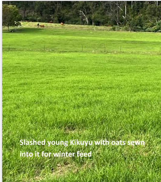
Slashed young Kikuyu with oats sewn into it for winter feed