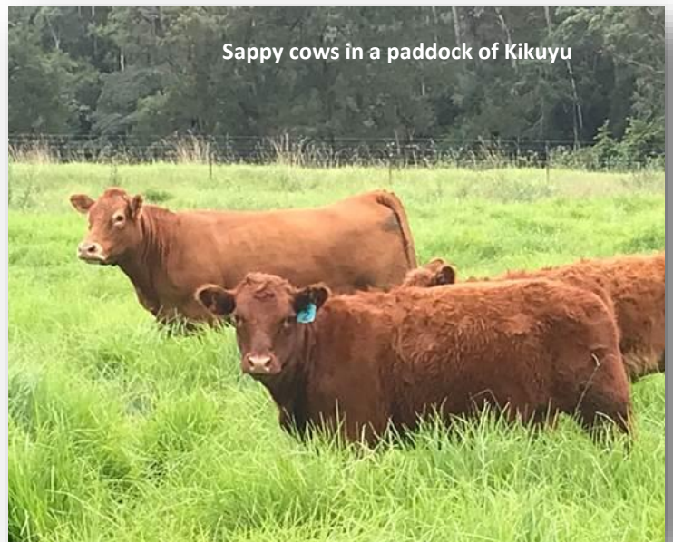
Sappy cows in a paddock of Kikuyu