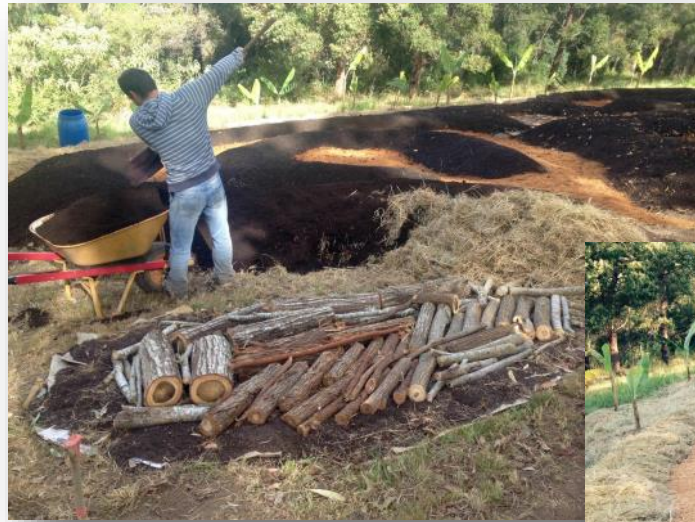
This A&A Worm Farm Waste Treatment System was installed on a steep slope at Pythonwood in 2013 by our local Rosewood Environmental

T rish Crick's bee garden is thriving, growing in Hugelkultur beds, floating above a sub-surface piping grid distributing nutrient-rich liquid fertiliser, released at root level.