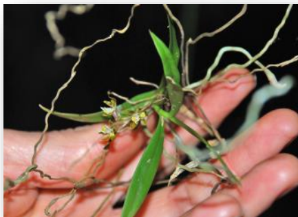
Tangle Orchid ( Plectorrhiza tridentata )

their leaves completely- why bother when your roots are photosynthetic?